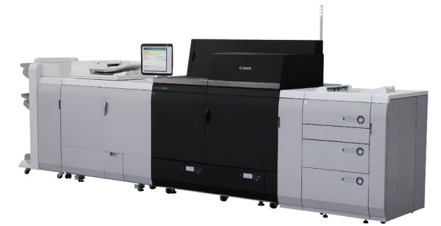
Canon imagePRESS C8000/10000 80-100 PPM ~ 100K-1 Mil/Month