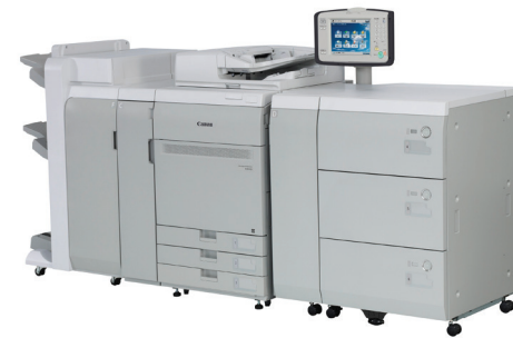
Canon imagePRESS C710/810/910 Canon 70-90 PPM ~ 5-100K/Month